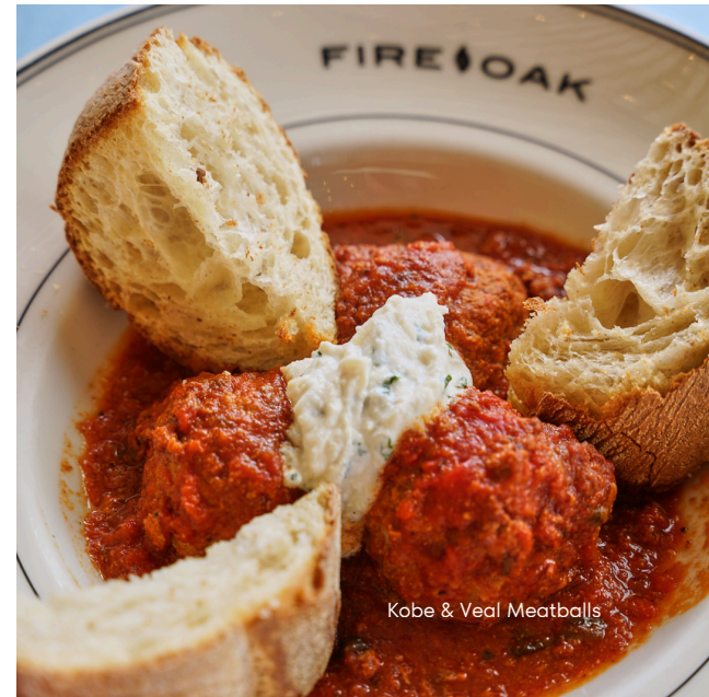
Kobe & Veal Meatballs