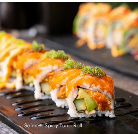
Salmon-Spicy Tuna Roll