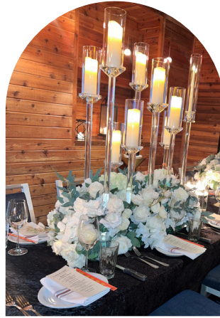
The Candle Room