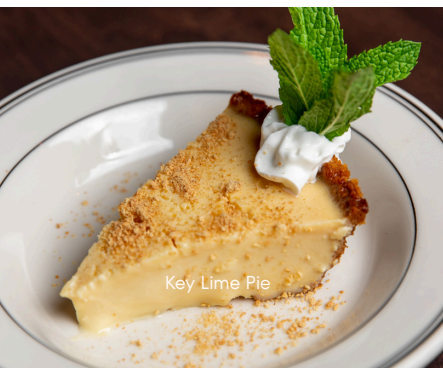
Key Lime Pie

14OZ NEW YORK STRIP sautéed french beans, scalloped potatoes au gratin