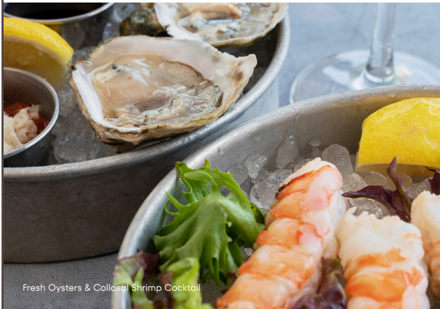
Fresh Oysters & Colossal Shrimp Cocktail

with lobster in a light saffron tomato cream sauce