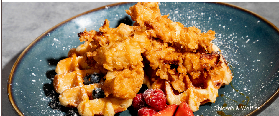
Chicken & Waffles

farm fresh poached eggs, multigrain toasted bread, heirloom cherry tomatoes, chili flakes, arugula salad