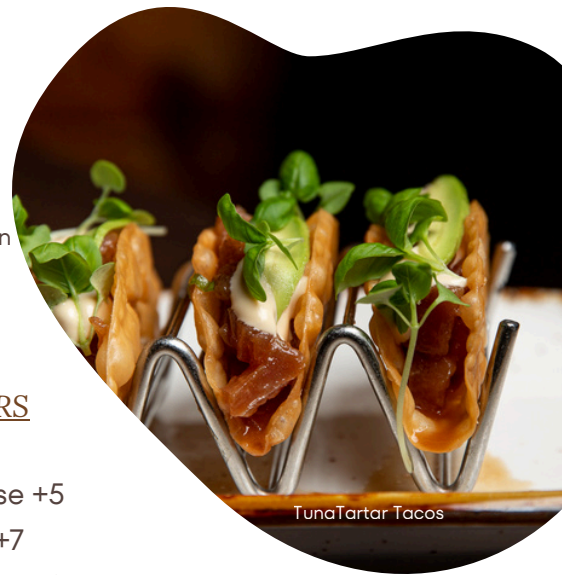
Tuna Tartar Tacos