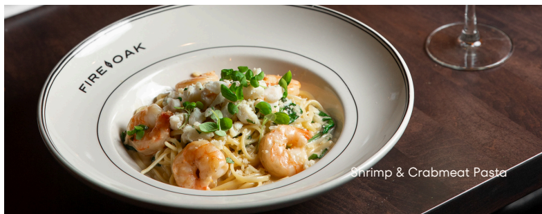
Shrimp & Crabmeat Pasta