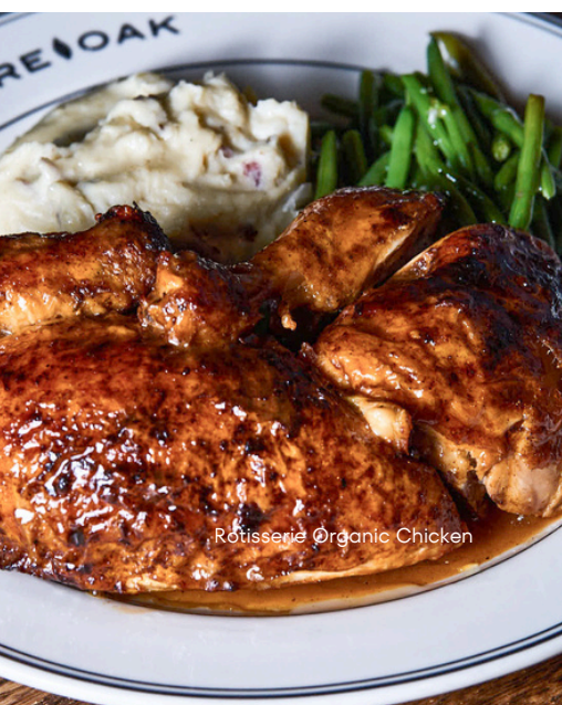
Rotisserie Organic Chicken

*Price does not include tax, gratuity or applicable Private Dining Fees