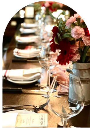
The Tavern Room