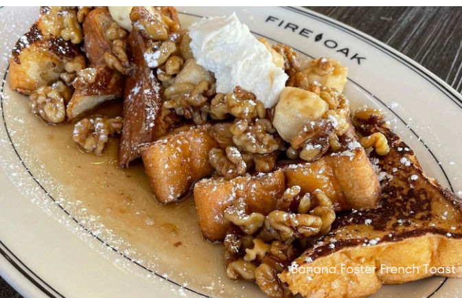
Banana Foster French Toast