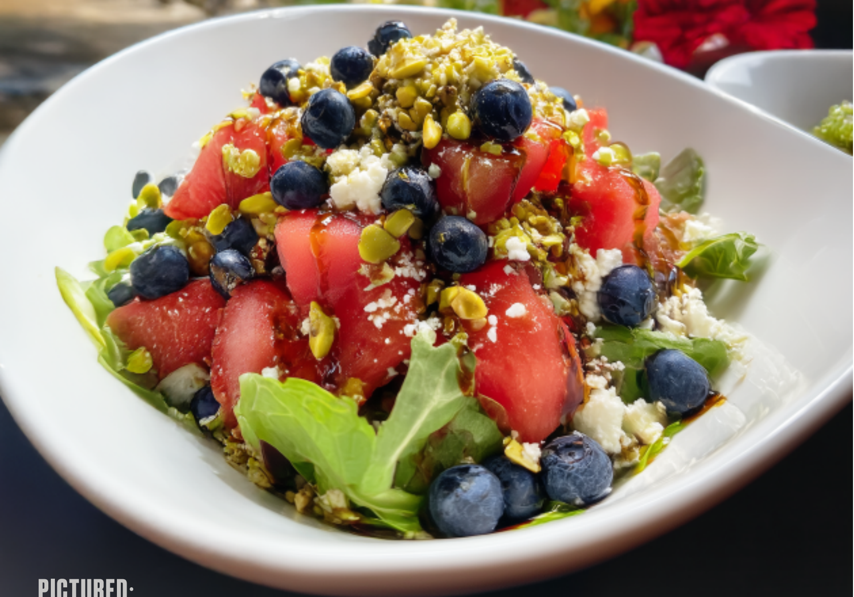
PICTURED: WATERMELON CRUNCH SALAD

TAKE HOME AN E.B.C. LOGO PINT FOR $2.99. ADD AS A SOUVENIR TO ANY BEER YOUR ORDER!