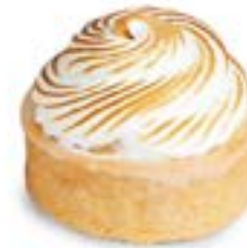
Mini Passion Fruit Cream Cloud