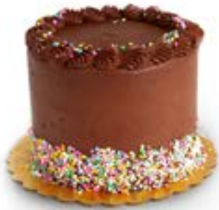
All American Birthday Cake