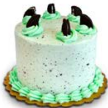
Oreo Mint Chip Cake