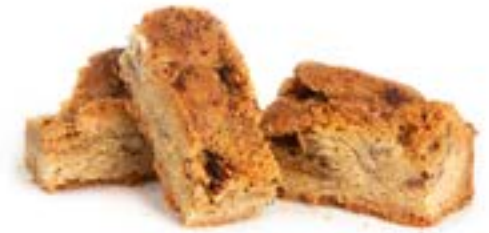
Brown Butter Pecan Blondie Bites