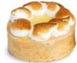
Mini Lemon Cream Cloud