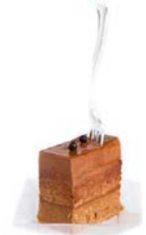
Le PB Kit Kat