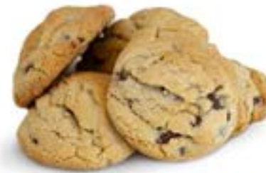
Spinky's Chocolate Chip Cookies