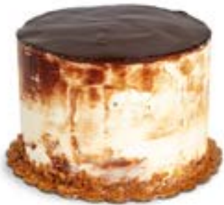
Nutella Crunch Cake