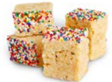
Brown Butter Rice Krispy Bites