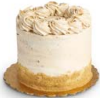
Cookie Butter Craving