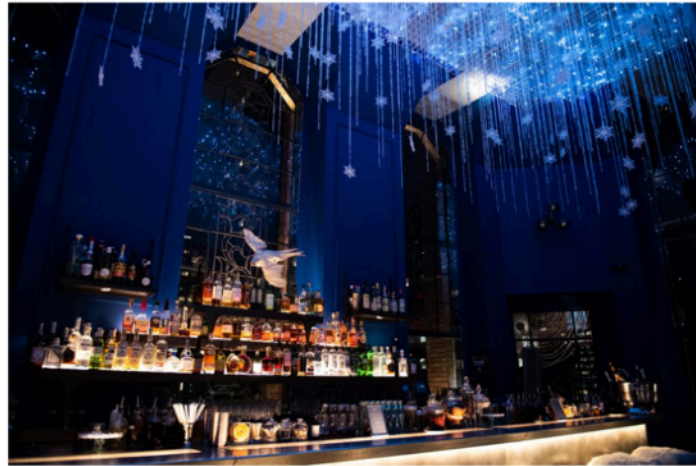
Ophelia Lounge NYC

There's nowhere in the world quite like New York City during the holiday season . If you think the Big Apple is bright and bustling throughout the year, it becomes that much more so during the winter months. Between the decked-out department stores, the Rockefeller Christmas Tree, and all the twinkly lights everywhere you go, Christmas in New York is nothing short of magical.