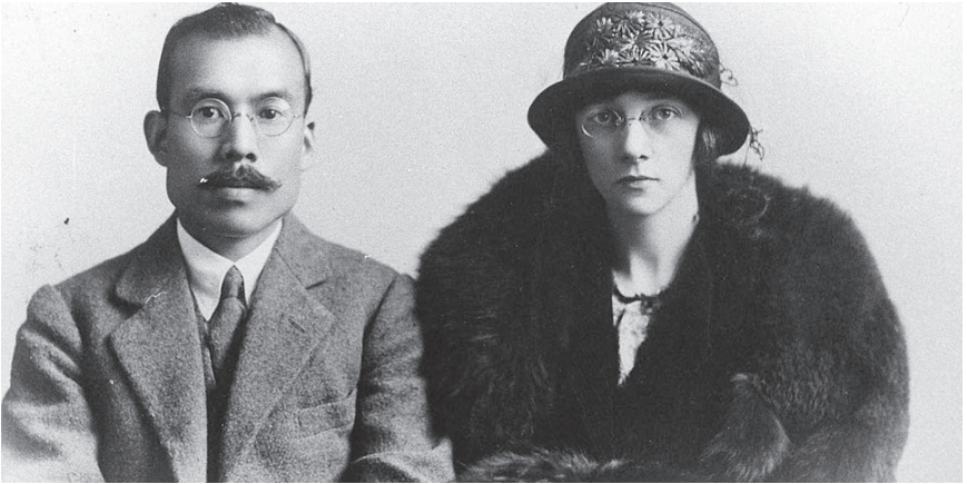
MASATAKA TAKETSURU AND RITA COWAN, C. 1920 THE FOUNDER OF JAPANESE WHISKY AND HIS SCOTTISH WIFE