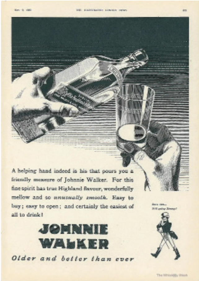
1935 JOHNNIE WALKER ADVERTISEMENT