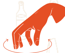
UNDER THE TABLE (SOTTOBANCO)