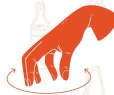
UNDER THE TABLE (SOTTOBANCO)