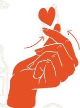
I LOVE YOU (TI VOGLIO BENE)