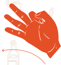
IF I CATCH YOU! (SE TI PRENDO!)