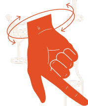
NOT SO MUCH, NOT SO GOOD (NON COSÌ TANTO, NON COSÌ BENE)