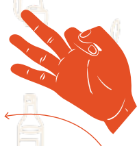
IF I CATCH YOU! (SE TI PRENDO!)