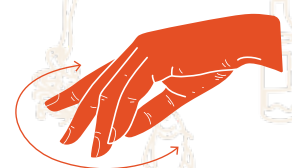
LET'S GO (ANDIAMO)