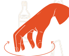
UNDER THE TABLE (SOTTOBANCO)