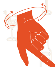
NOT SO MUCH, NOT SO GOOD (NON COSÌ TANTO, NON COSÌ BENE)