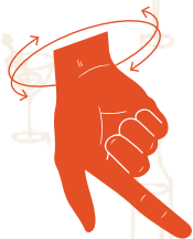
NOT SO MUCH, NOT SO GOOD (NON COSÌ TANTO, NON COSÌ BENE)