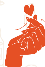
I LOVE YOU (TI VOGLIO BENE)