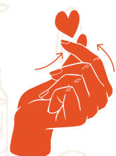
I LOVE YOU (TI VOGLIO BENE)