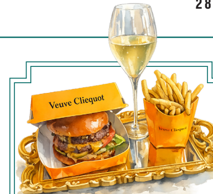
BURGER & BUBBLES smash burger, french fries, glass of Veuve Cliquot champagne $48