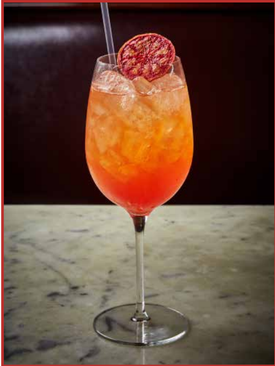
FIGEOLLO SPRITZ APEROL, PASSION FRUIT, LIME, PROSECCO