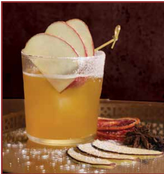
APPLE, WHISKEY, CINNAMON JACK DANIEL'S RYE, AMARO, APPLE CIDER, MAPLE, CINNAMON