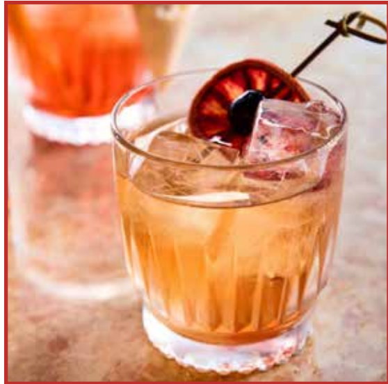
OLD FASHIONED WOODFORD RESERVE BOURBON, BERGAMOT SYRUP, BITTERS