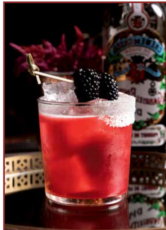
RED BERRY MARGARITA TEQUILA, CASSIS, WILD BERRIES, LIME