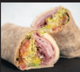
[LOW CARB] WRAPS