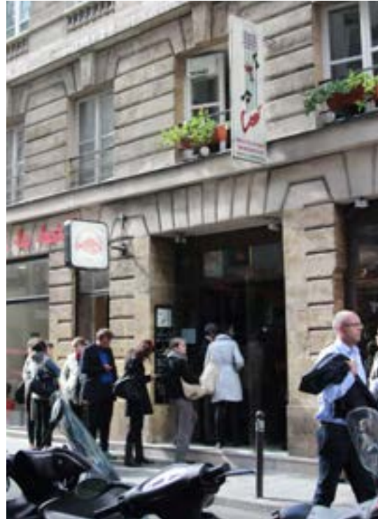
Original Cosi location – 54 Rue de Seine, Paris