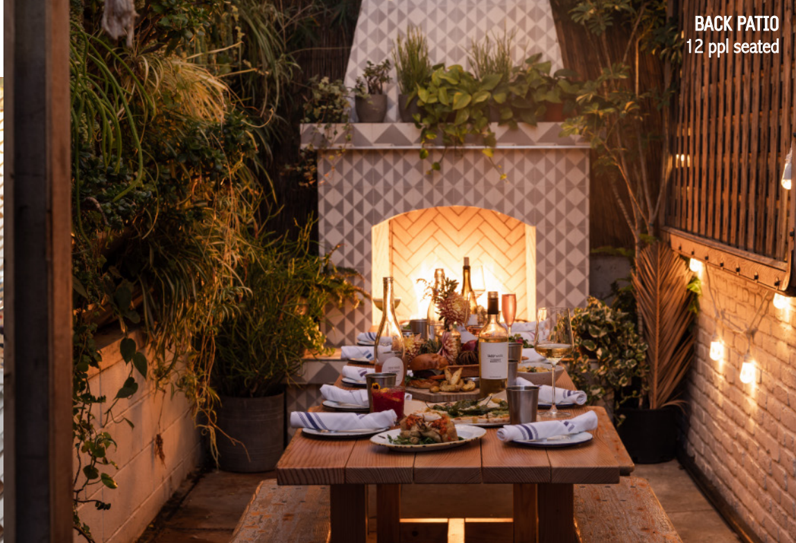
BACK PATIO 12 ppl seated