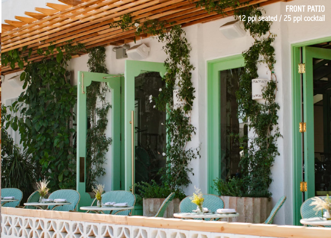
FRONT PATIO 12 ppl seated / 25 ppl cocktail