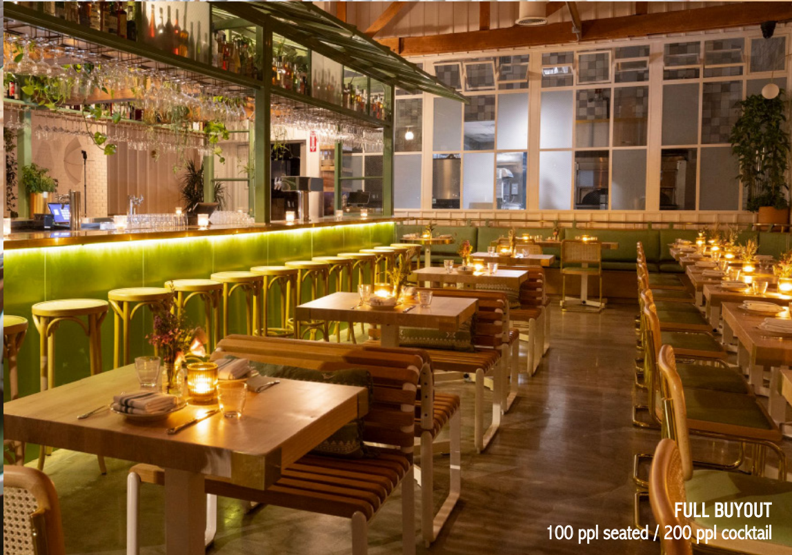
FULL BUYOUT 100 ppl seated / 200 ppl cocktail