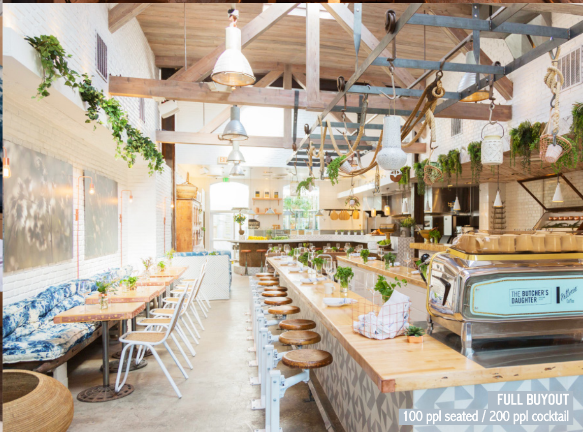
FULL BUYOUT 100 ppl seated / 200 ppl cocktail