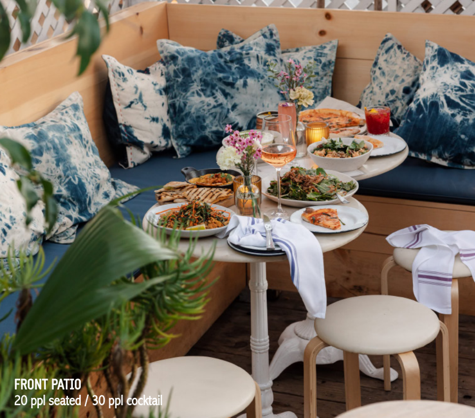
FRONT PATIO 20 ppl seated / 30 ppl cocktail