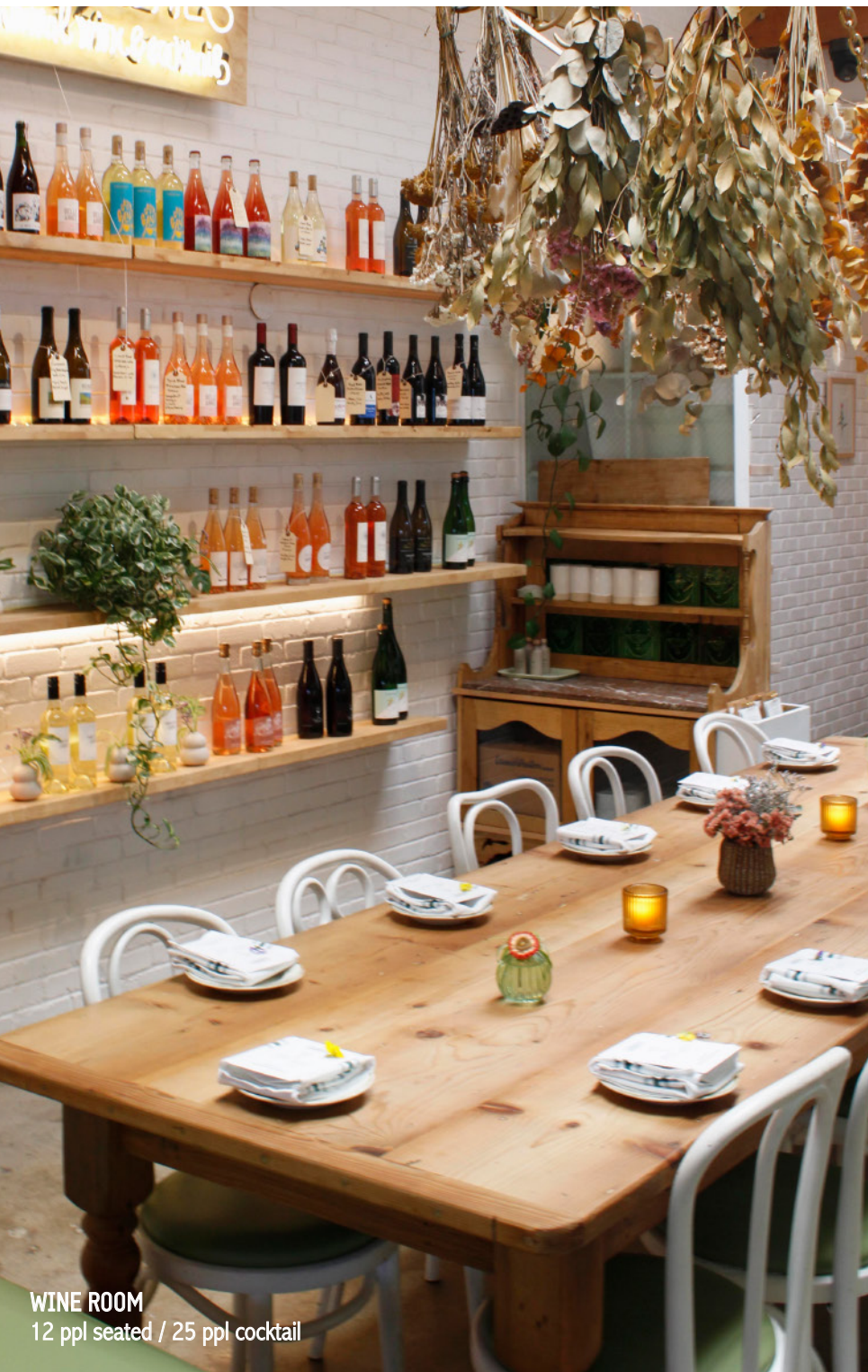
WINE ROOM 12 ppl seated / 25 ppl cocktail