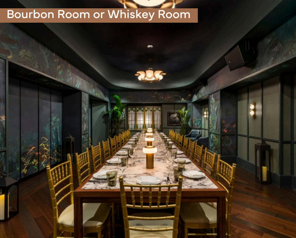
Bourbon Room or Whiskey Room