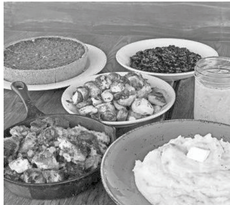
Thanksgiving sides to-go from Beckett's Table and Southern Rail.

Need just the sides? Each of these signature la cart dishes serves six: bacon cheddar biscuit stuffing ($29), Yukon gold mashed potatoes ($28), wood oven roasted Brussels sprouts with lemon honey vinaigrette ($32), caramelized onion turkey gravy ($18), organic cranberry sauce ($18), whole fig and pecan pie ($31), and a pint of citrus zest cream cheese ice cream ($10). A pre-selected six-pack of wine is also available for $99. Orders must be placed by Nov. 20. Pickup window is noon-6 p.m. on Nov. 25. Orders must be picked up at