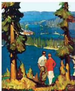
FINGER LAKES NEW YORK