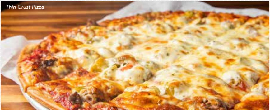
Thin Crust Pizza

Spinach • Jalapenos • Black Olives • Anchovies • Onions • Mushrooms Green Peppers • Garlic • BBQ Sauce • Fresh Tomatoes • Roasted Peppers Italian Sausage • Fresh Basil • Bacon • Pepperoni • Meatballs • Italian Beef Chicken • Ricotta Cheese • Giardiniera