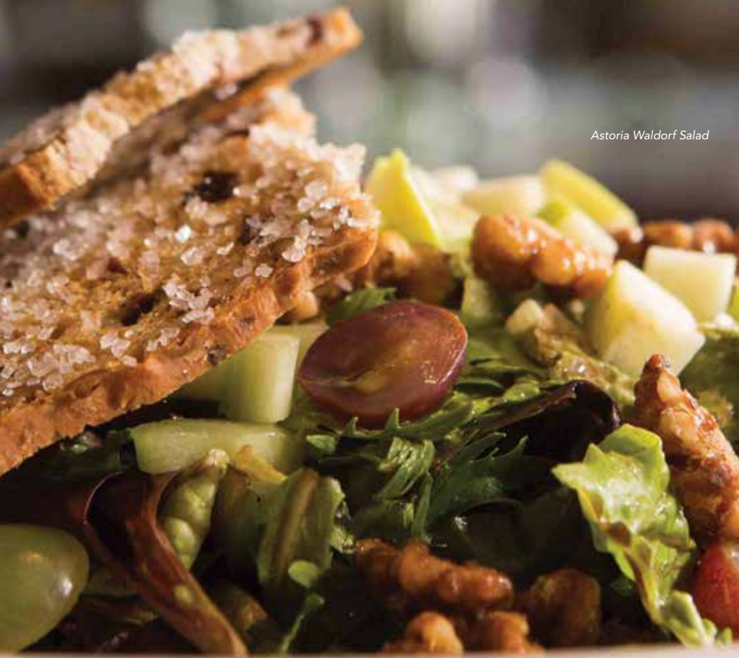
Astoria Waldorf Salad