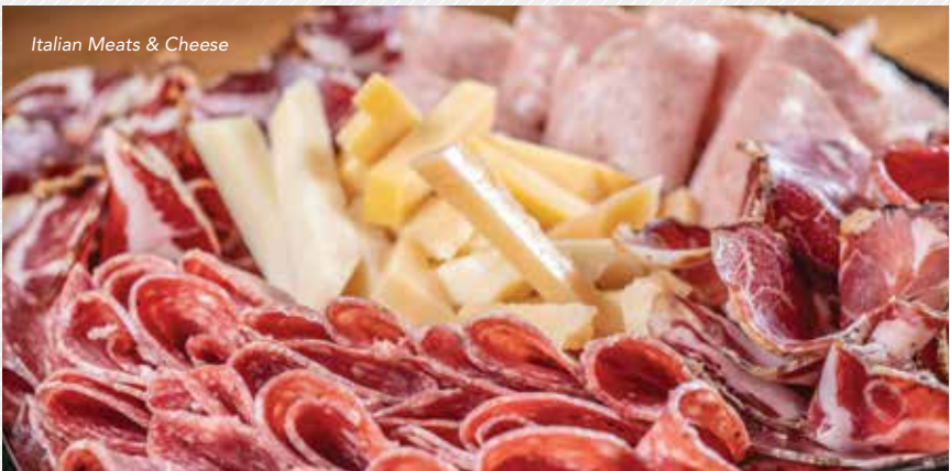
Italian Meats & Cheese