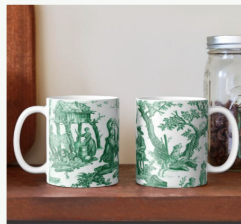
Kosher Parev Toile de Jouy Mugs

The Kosher Hub have a wonderful range of classic homewares for the Kosher Kitchen. Toile de Jouy is a historical classic French country print making a come back.