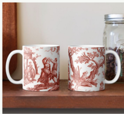
Kosher Meat Toile de Jouy Mugs