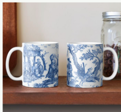
Kosher Dairy Toile de Jouy Mugs