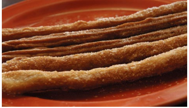
Vanilla based dough deep fried and served with chocolate and condensed milk