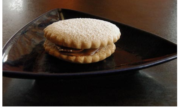
Two homemade vanilla cookies joined with caramel milk and topped with powdered sugar