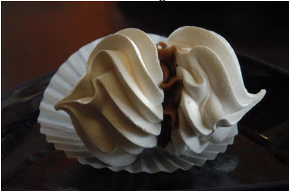
Two merengues joined with caramel milk