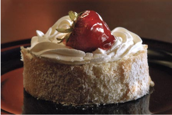
White cake, whipped cream, fresh strawberries inside and outside