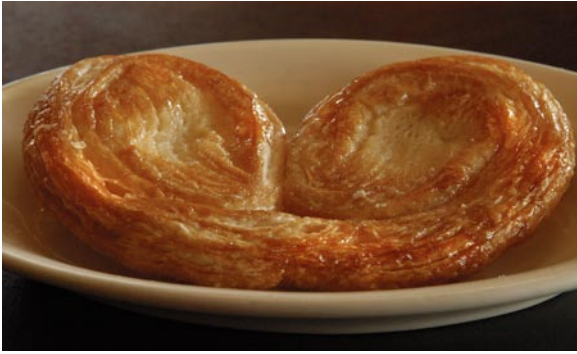
Heart shape puff pastry with sugar