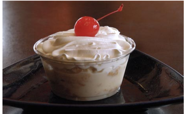
Cake moist with a mix of milk, condensed milk and evaporated milk; topped with whipped cream