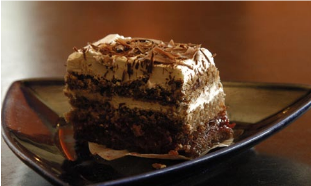
Chocolate cake, cherry gel, condensed milk, chocolate chips, toasted almonds, whipped cream, shredded chocolate