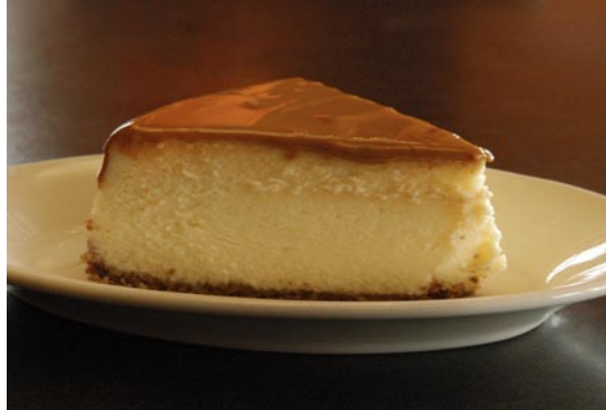
Homemade cheese cake topped with caramel milk, or chocolate, or fresh strawberries