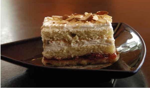
White cake, cherry gel, condensed milk, whipped cream, chocolate chips, toasted almonds