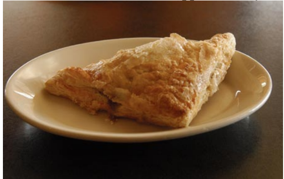
Puff pastry dough filled with guava, guava & cheese, dulce de leche & cheese, apple, or cherry