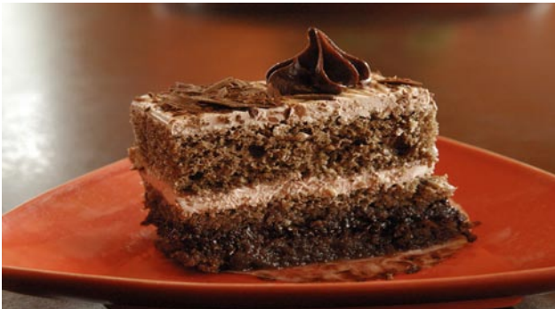
Chocolate cake, chocolate fudge, chocolate whipped cream, shredded chocolate