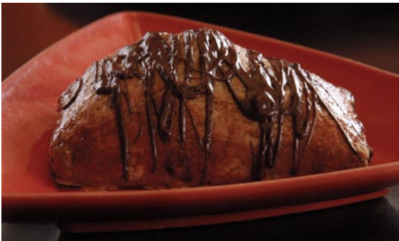
Croissant filled with chocolate & topped with chocolate