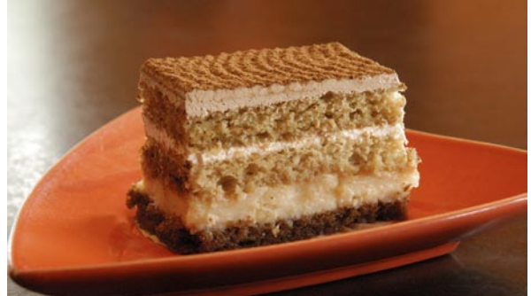
Chocolate and white cake moist with coffee syrup; homemade pastry cream, whipped cream and cocoa