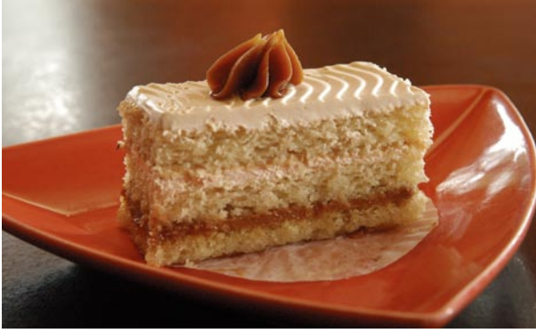
White cake, caramel milk, caramel milk whipped cream