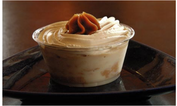
Cake moist with a mix of milk, condensed milk, evaporated milk, and caramel milk; topped with caramel whipped cream