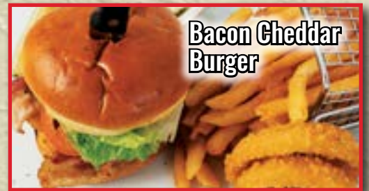
Bacon Cheddar Burger