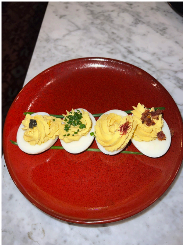
Deviled Eggs (toppings are Saffron, Caviar, Scallions, and Candied Bacon)