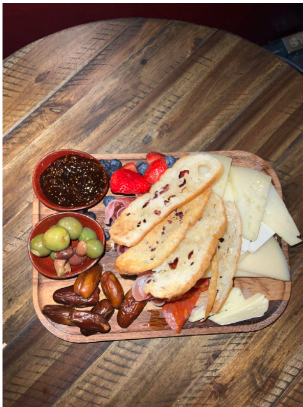
Cheese and Charcuterie Board