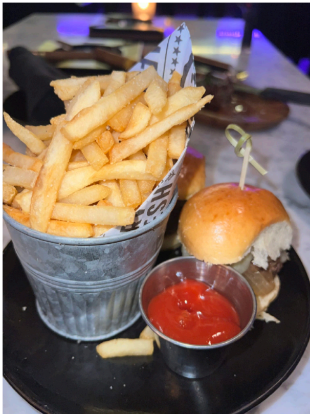
Wagyu Beef Sliders