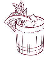
FRESNO PALOMA | 22 Casamigos Reposado Tequila Grapefruit, Fresno Chile Mint, Lime