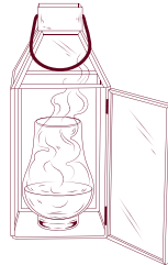
SMOKED MANHATTAN | 22 Tin Cup Rye Whiskey, Yellow Chartreuse Carpano Dry Vermouth, Mole Bitters, Smoke