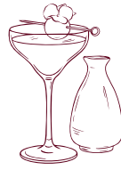
LYCHEE SAKETINI | 21 Belvedere Vodka, Nigori Sake Lychee, Yuzu, Orange Blossom