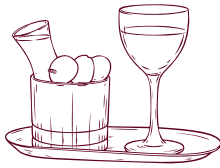
FILTHY MARTINI | 20 Grey Goose Vodka, Housemade Brine Blue Cheese Olives