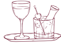
TOMATO MARTINI | 20 Elyx Vodka, Dolin Blanc Tomato Water Brine, Basil