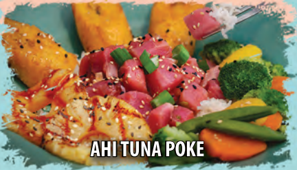
AHI TUNA POKE

Sashimi ahi tuna, red onions, sesame seeds and scallions tossed in Hawaiian Poke sauce over jasmine rice. Served with grilled pineapple slices, fried sweet plantains and teriyaki vegetables. 16.99