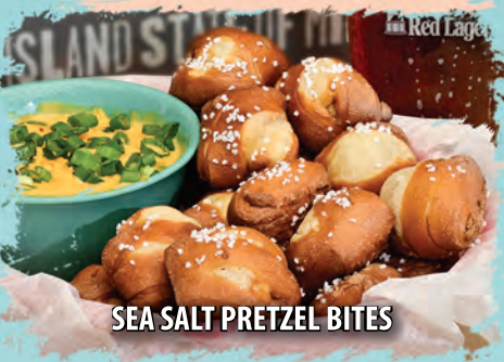
SEA SALT PRETZEL BITES

Served with warm beer cheese sauce topped with scallions. 9.89