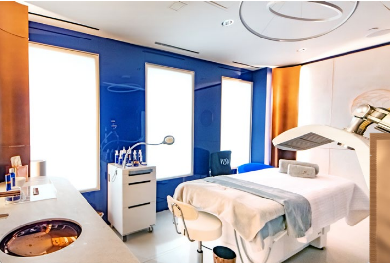
FROM LEFT: A treatment room at The Skin Lab; The Eye Patches, $125 (for six), AUGUSTINUS BADER , augustinusbader.com

Beloved skin and haircare brand Augustinus Bader has opened The Skin Lab at The Webster boutique in SoHo (its first standalone skin clinic in the U.S. and second-ever location) to offer clients skin analysis and facial and body treatments. Powered by TFC8, a proprietary cocktail of vitamins and amino acids, the brand's skin and haircare products are adored by the likes of Gwyneth Paltrow, Victoria Beckham, Dakota Johnson and Margot Robbie. augustinusbader.com