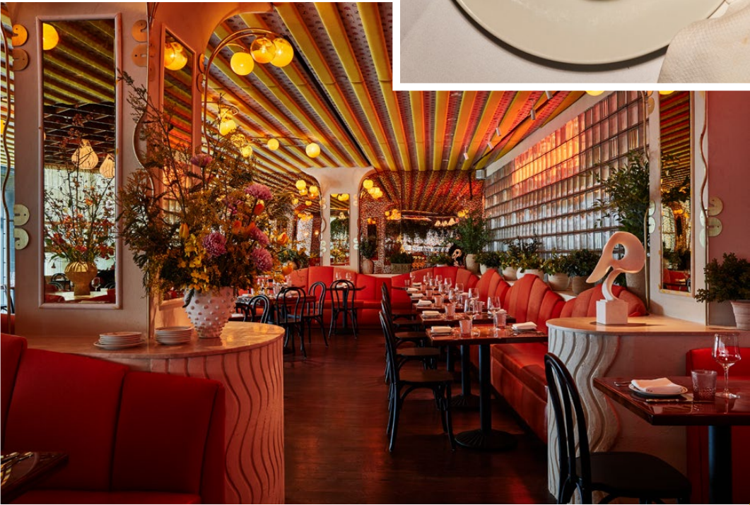
The dining room at Bad Roman

FOR MORE ON NEW YORK CITY, VISIT DUJOUR.COM/CITIES