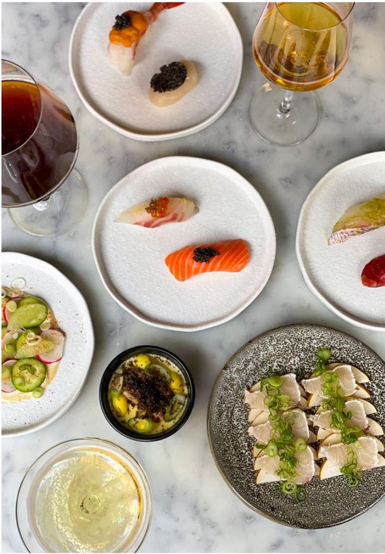
Sushi and beer at Moody Tongue Sushi