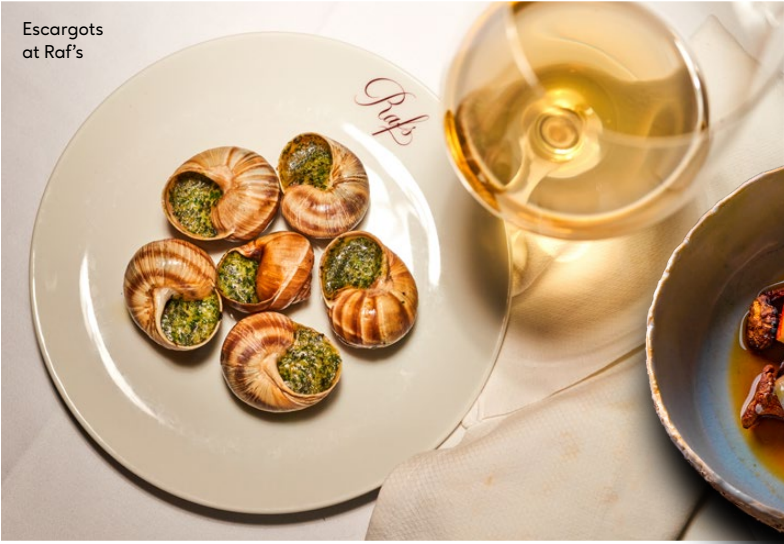
Escargots at Raf's