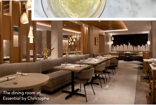
The dining room at Essential by Christophe