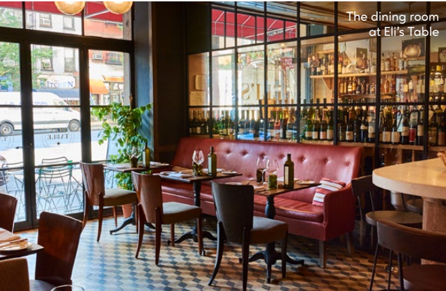
The dining room at Eli's Table

pepperoni, a white pie and a Sicilian with tomatoes and parmesan—both available by the slice or pie. finipizza.com