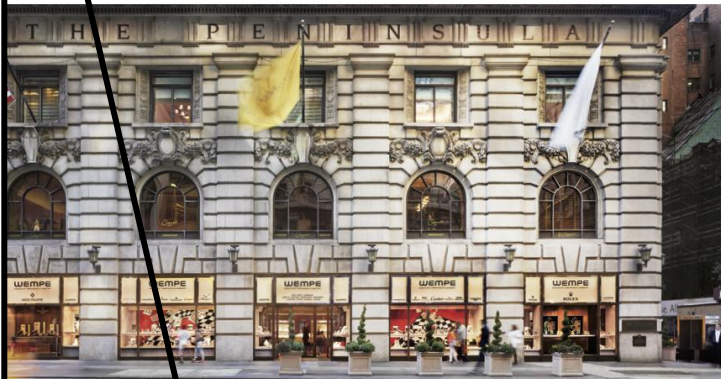
CITY GUIDE: NEW YORK CITY