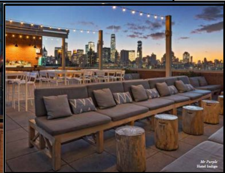
Mr. Purple Hotel Indigo

On those clear June days that feel perfect for the beach, it's the closest thing to sand and surf in Midtown