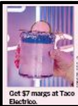
Get $7 margs at Taco Electrico.