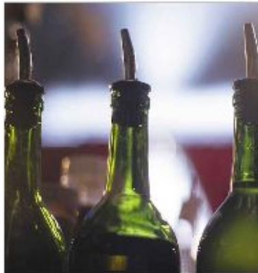
Steamy Hallows on East Sixth Street offers a wealth of "Harry P..."

We went to its grand opening on Wednesday to get a glimpse into the spooky space. Here's what you'll find inside.