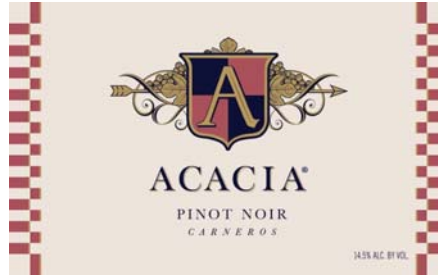
Acacia Pinot Noir 2016 Appellation: Carneros, Napa Valley Varietal: 100% Pinot Noir Aged: Oak Aging

"The 2016 Carneros Pinot Noir opens beautifully offering layers of red-fruit aromas; Bing cherry, cranberry and sun-ripened raspberry. The aromas ring true on the silky textured palate where the juicy fruit core intermingles with baking spice, black tea and wet stone minerality."