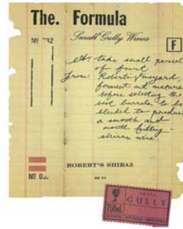
Small Gully "The Formula Robert's Shiraz" 2014 Appellation: Adelaide Plains, AU Varietals: 100% Shiraz Aged: 24 Months on Oak

Cocoa Rubbed Prime Sirloin, Red Wine Risotto, Cherry-Red Wine Reduction