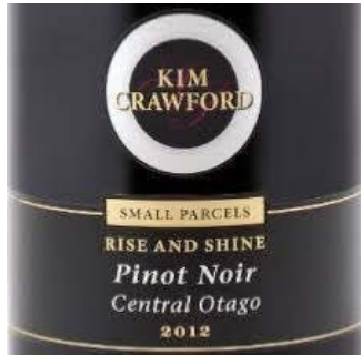
Kim Crawford "Rise and Shine" Pinot Noir 2014 Appellation: South Island, NZ Varietal: 100% Pinot Noir Aged: Oak Aging