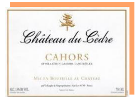
Chateau Du Cedre Cahors 2014 Appellation: Cahors, France Varietals: 90% Malbec, 5% Merlot, 5% Tannat Aged: 20 - 22 Months in French Oak

Braised Short Rib Stuffed Piquillo, Red Wine Demi