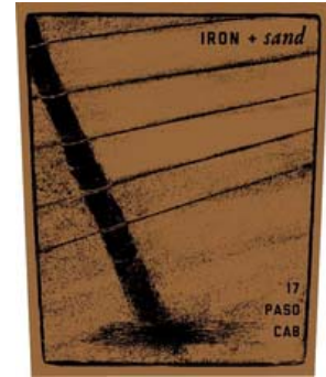
Iron & Sand Cabernet 2017 Appellation: Paso Robles Varietals: 89% Cabernet Sauvignon, 6% Petit Verdot, 5% Petite Sirah Aged: 12 Months Oak Aging

Grilled Chicken Sausage Flatbread, Arugula, Lemon