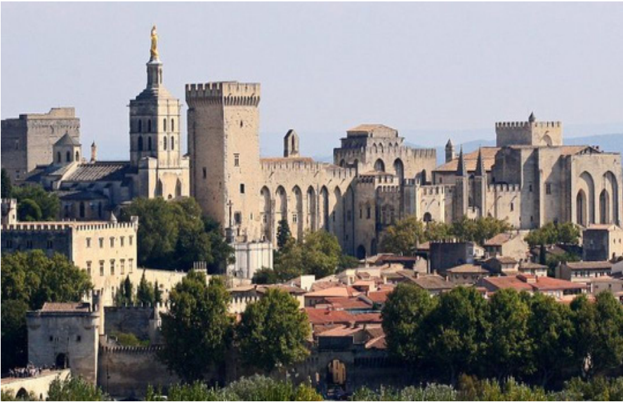
Palace of the Popes - Avignon, Châteauneuf-du-Pape