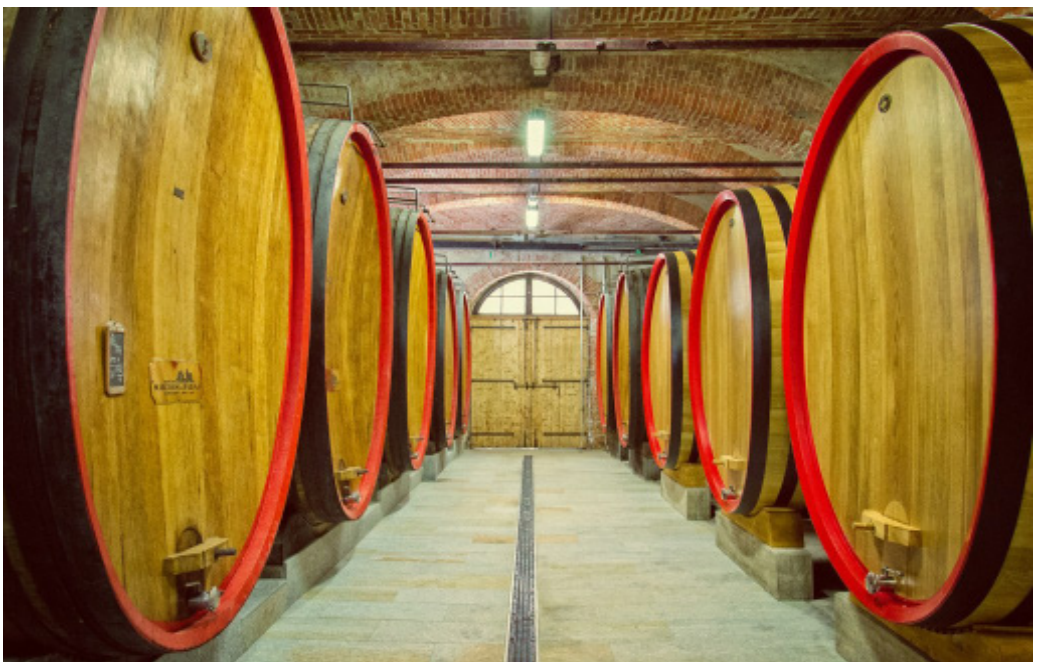
Famous Dolci of Piemonte