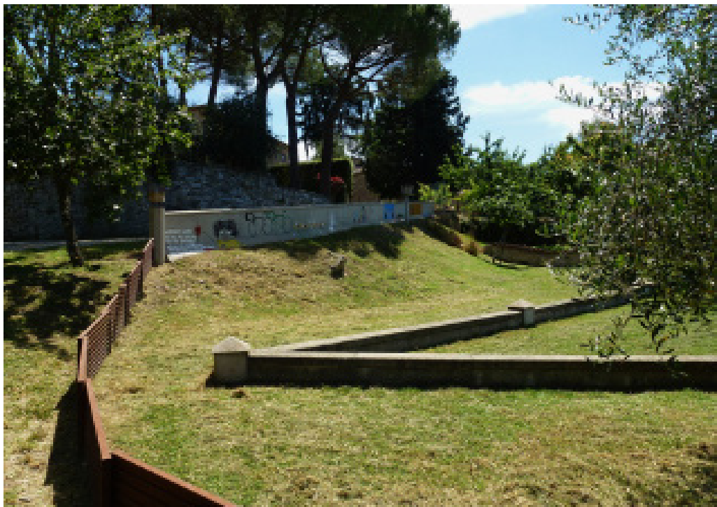
Yo no quiero ver mas a mis vecinos - Carlos Garaicoa