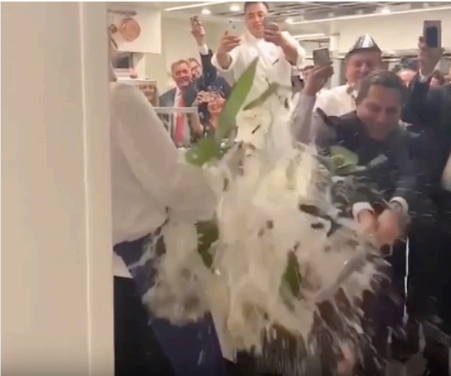
How to Saber in Yountville