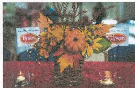
Thank you to Tyson—Title Sponsor!