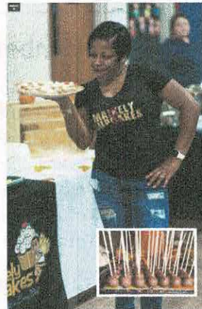
(left) Runner-Up Best Sweet Taste: Mainly Cupcakes