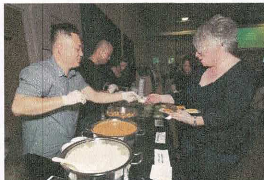
Runner-Up Best Savory Taste: Chokh Di Noodle House