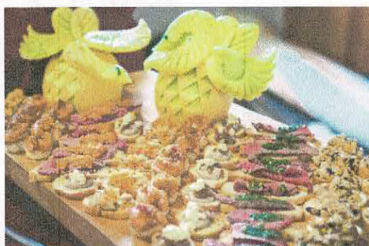
Best Presentation: Jefferson St. Deli

Thank you to our vendors, sponsors, silent auction contributors, musicians, photographer, volunteers, and especially our GUESTS for making Taste 2017 such a success!