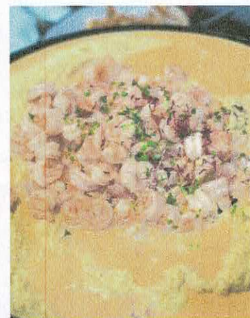
Best Savory Taste: Stone Table