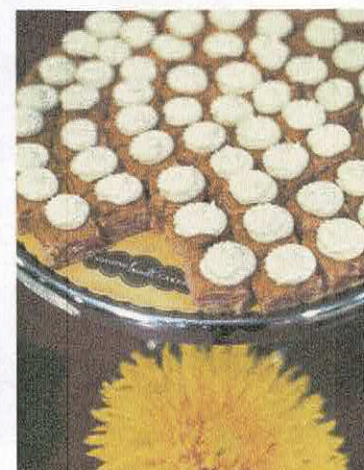
Best Sweet Taste: Nothing Bundt Cakes