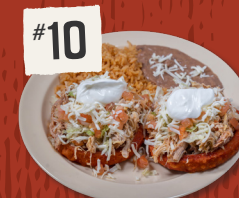
TWO SOPE $14.99