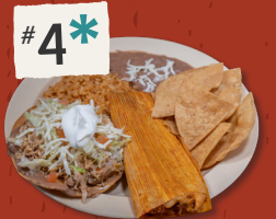
TOSTADA & TAMALE $14.99