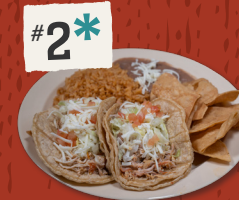
TWO TACOS $14.99