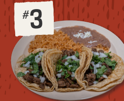
THREE TACOS $14.99