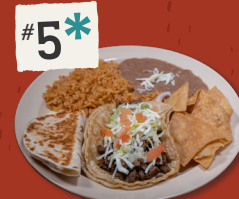
TACO & QUESADILLA $14.99