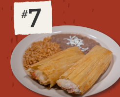
TWO TAMALES $13.99