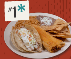
TACO & TAMALE $14.99