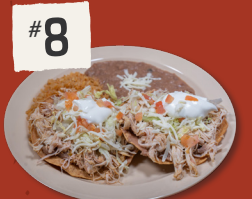
TWO TOSTADAS $14.99