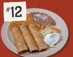
THREE FLAUTAS $14.99