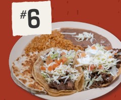
TACO, TOSTADA & QUESADILLA $14.99