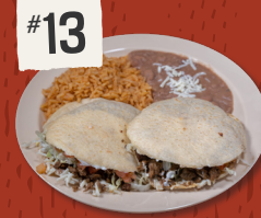
TWO GORDITAS $14.99