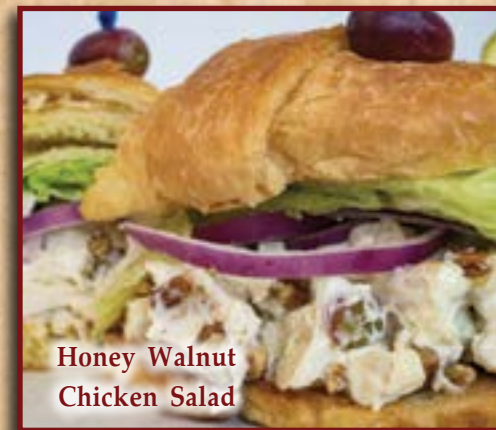
Honey Walnut Chicken Salad

Cajun Flounder Sandwich 10.49 Cajun Spiced & grilled.