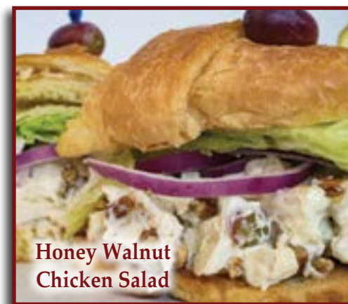
Honey Walnut Chicken Salad