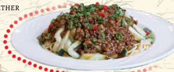
MEAT SAUCE OVER NOODLES