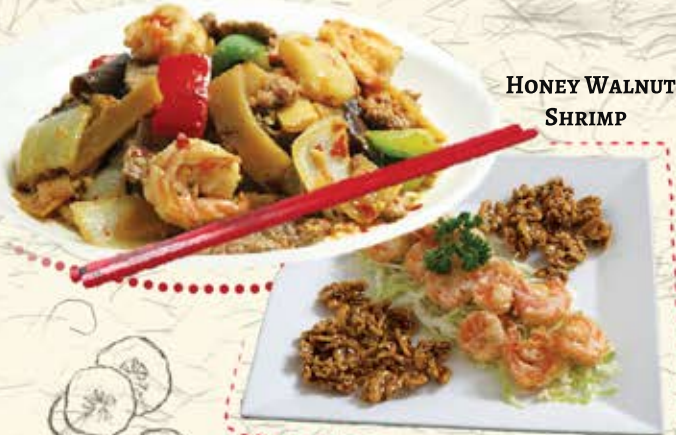
HONEY WALNUT SHRIMP