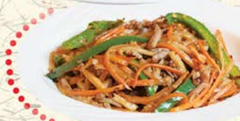
SHREDDED PORK WITH VEGETABLES