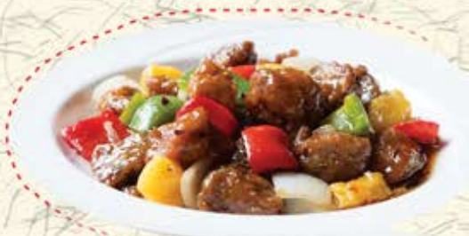
SWEET & SOUR PORK