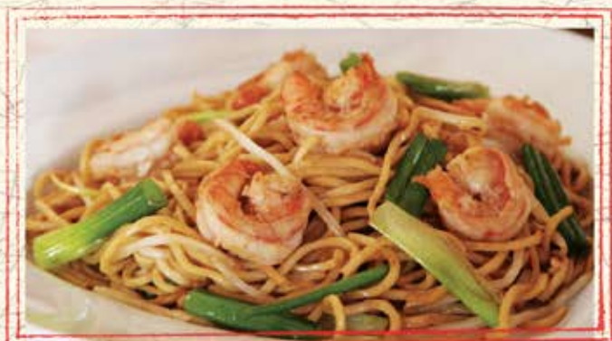
SHRIMP CHOW MEIN