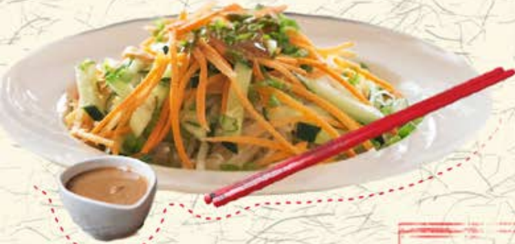
BEAN SPROUT CUCUMBER SALAD