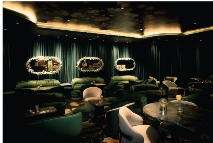
Easy's wintry Cocktail Lounge

As the seasons get colder and the world gets cheerier, Miracle on Easy Street will return to Easy's Cocktail Lounge from Dec. 15 to Dec. 31. Guests attending a special show at the famed institution—like the Santa Baby Diva's Night on Dec. 23—can complement their night with one of Easy's signature holiday drinks. Will it be a sip of the Naughty Gingerbread or perhaps the Pistachio Martini?