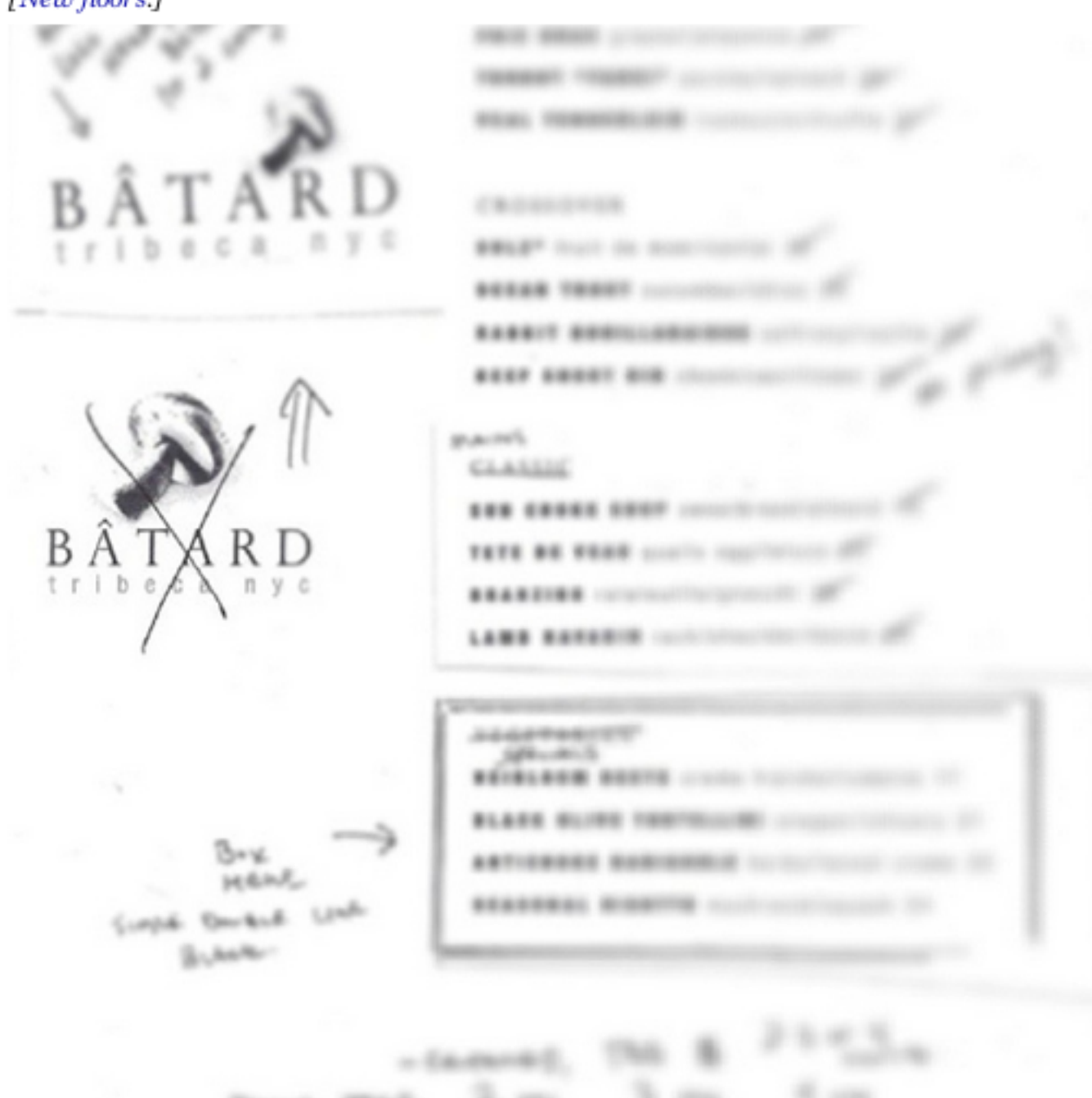
[A rough draft of the menu with the dishes blurred out.]