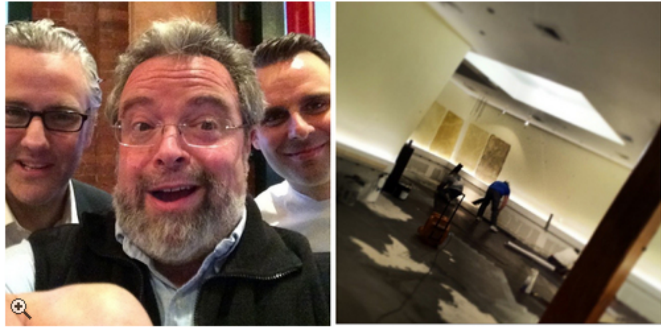
[The Bâtard trio; the old Corton space]

Tuesday, April 29, 2014, by Greg Morabito