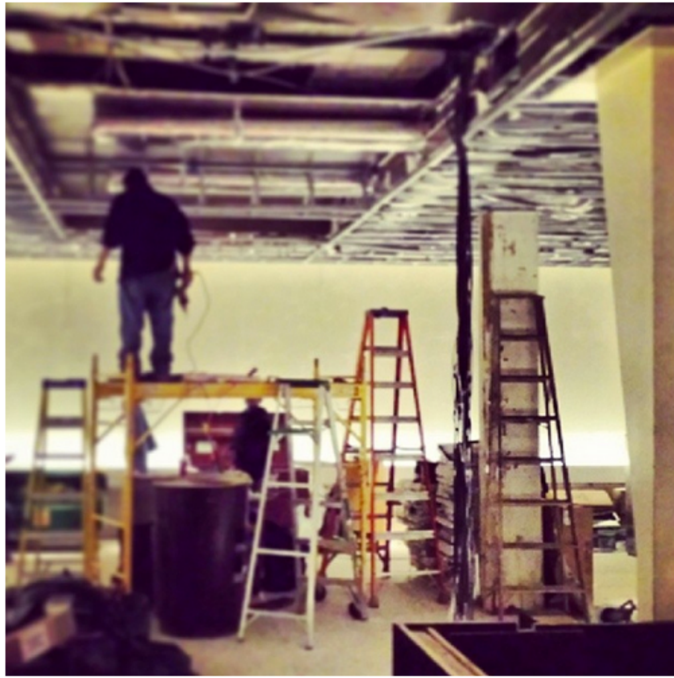
[The build-out begins.]