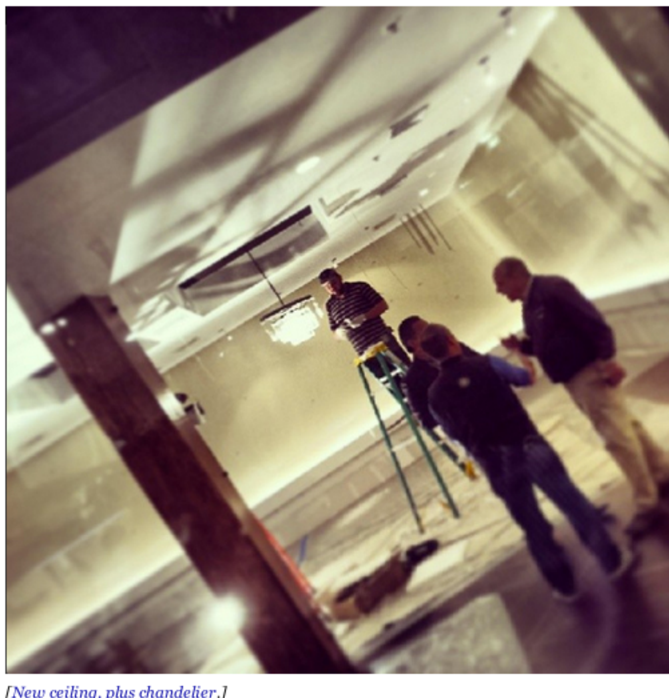
[New ceiling, plus chandelier.]