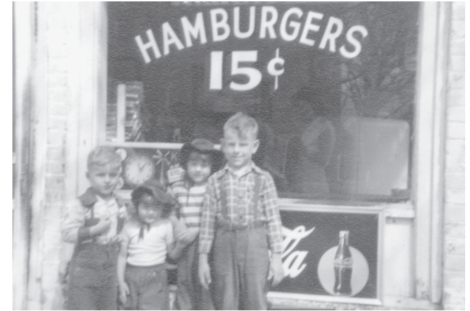
Quality food our family has prepared since 1949 and serving Wichita since 1977

Famous for Old Fashioned Burgers, Fries & Shakes WICHITA, KANSAS