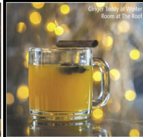
Ginger Toddy at Winter Room at The Roof