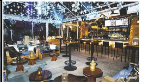
Ski Chalet at Haven Rooftop

Winter Room at The Roof A champagne parlor in the sky awaits inside the Winter Room, a Veuve Clicquot wonderland of snow on the terrace of The Roof (tented and heated, of course). Inside, snowy branches bring a little of the outside in, with blankets and comfy pillows inviting visitors to lounge with a hot cocktail and warm bubble waffle. Up on the 29th floor, you'll have a picture-perfect view once Central Park is covered in snow. Through March 2018, Viceroy Hotel, 124 W. 57th St.