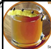
"Get Out" cocktail at The Roof at Viceroy

David's Northern Italian Steakhouse Inspired by the Oscar-nominated actor, David's has created the $15 cocktail for its bar viewing party. The Cognac-based Margot Robbie, the prosecco and Aperol-based Meryl Streep, and the Jack Daniel's whiskey-based Daniel Day-Lewis. 8 p.m.; 447 Lexington Ave., davidson.com