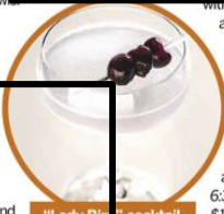
"Lady Bird" cocktail at Irrington

WITH FILM BUFS Theater, bar and restaurant will be playing the Oscars in all three spaces. Seats first-come, first-served. The bar will have a ballot contest with free drinks and prizes for winners. Splurge on $150 VIP tickets for a five-person booth, Champagne and snacks. 6:30 p.m., $10-$150; 40 Bogart St., Bushwick, syndicatedbk.com