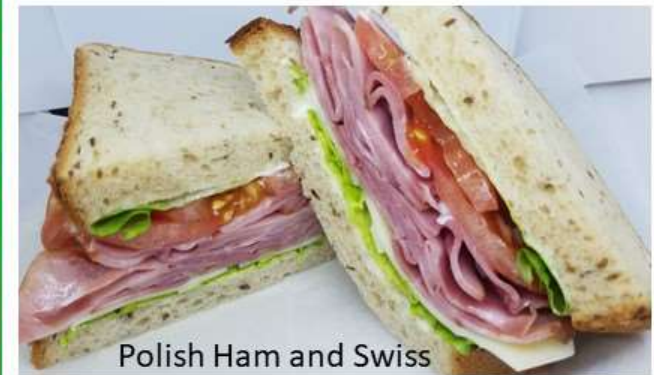
Polish Ham and Swiss

Half Build Your Own Sandwich- $3.48 Half Build Your Own Sandwich with a Cup of Soup- $6.78