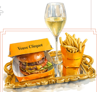
BURGER & BUBBLES smash burger, french fries, glass of Veuve Cliquot champagne $48