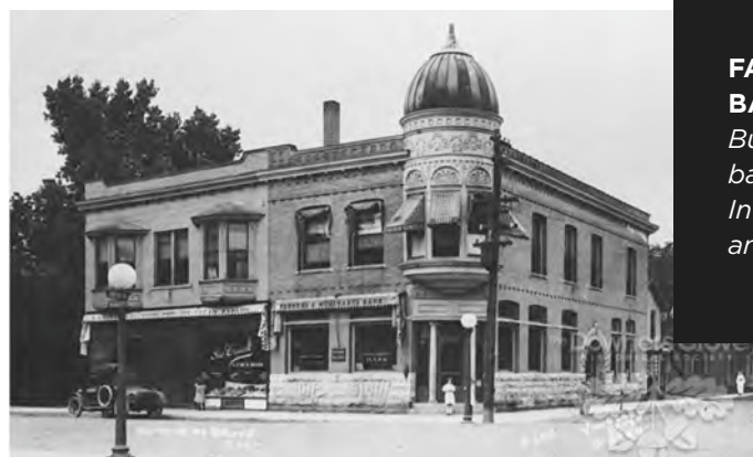
FARMERS AND MERCHANTS BANK BUILDING Built in 1892 and housed the bank, post office, and library. In 1944 the turret was removed and stone siding added