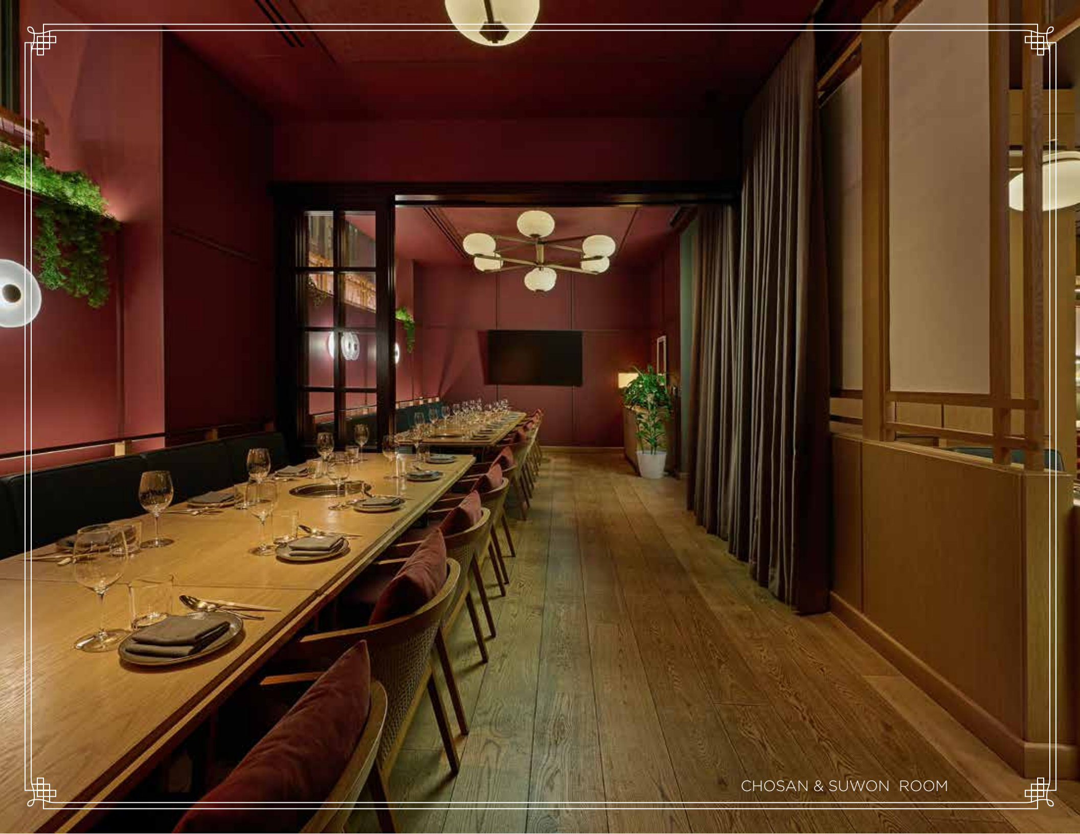
CHOSAN & SUWON ROOM