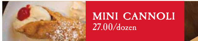
MINI CANNOLI 27.00/dozen

Layers of thinly sliced Boar's Head lean Italian seasoned roast beef, honey maple turkey breast and honey maple ham with your choice of swiss, provolone, or cheddar cheese served with shredded lettuce, tomatoes, or pickles. 3 FT. 45.00 | 4 FT. 55.00