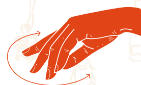
LET'S GO (ANDIAMO)