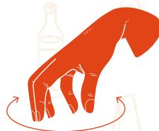
UNDER THE TABLE (SOTTOBANCO)