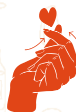
I LOVE YOU (TI VOGLIO BENE)