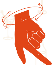
NOT SO MUCH, NOT SO GOOD (NON COSÌ TANTO, NON COSÌ BENE)